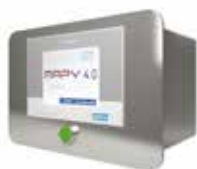
MAPY 4.0 as 19" input module

High-class components and the robust stainless steel design guarantee long service life and meet the high hygiene requirements in the food industry. Various interfaces (Ethernet, USB, barcode reader, printer) allow easy and flexible integration into existing systems. Exported data can be analyzed and documented with the optional WITT software GASCONTROL CENTER.