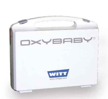
further information on www.oxybaby.com