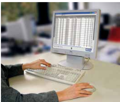
GCC data logging