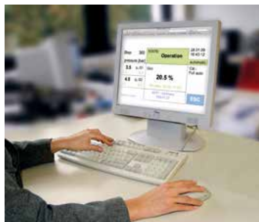
Remote Screen Monitoring with WEBVISIO