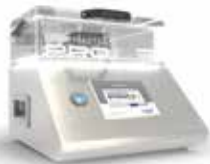
LEAK-MASTER® PRO 2