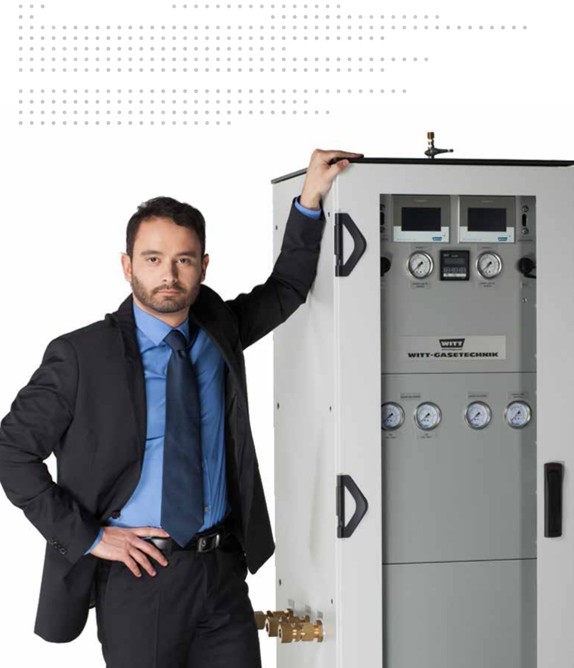
MED-MG for generating synthetic air used in medical applications

WITT provides the right solution for any application – from mobile gas mixer units through to central gas supplies.