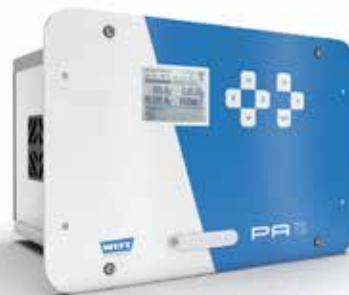
Also available as plug-in model

For best quality and efficiency in production. The compact gas analyzer PA enables the testing of O 2 / CO 2 for modified atmosphere packaging. Wherever results have to be recorded this comfortable analyzer can be used. This can be done as intermittent sampling via a needle or as continuous in-line analysis. Depending on the type of gas and analysis the PA contains a chemical, a zirconia and / or an infrared measuring cell. The PA has an integrated data log for the last 500 results, which relate to specific product names. Results can be transferred to a PC for editing and analyzing, e. g. with the WITT OBCC software.