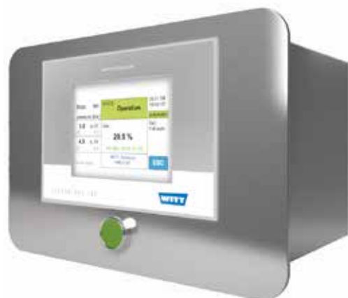
MAPY 4.0 as 19" plug-in model for the use as a premium inline analyzer

High-class components and the robust stainless steel design guarantee long service life and meet the high hygiene requirements in the food industry. Various interfaces (Ethernet, USB, barcode reader, printer) allow easy and flexible integration into existing systems. Exported data can be analyzed and documented with the optional WITT software GASCONTROL CENTER.