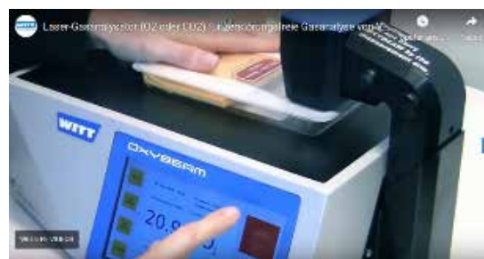
See our demo video on wittgas.com or at the WITT Youtube channel

OXYBEAM works with a class 1 infrared laser that does not require eye protection, due to its 760 nm wavelength. The product in the packaging as a whole does not even get warm as the laser power is less than 0.5 mW. The sensor measures the oxygen content over the full range from 0.1 to 100 % (CO 2 : 0 to 100%). The headspace of the packaging should be around 16 to 80 mm. All measurements by the device can naturally be stored and exported for evaluation and archiving. Calibration is performed once per year.