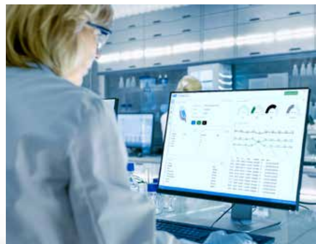
OBCC software to evaluate your quality controls