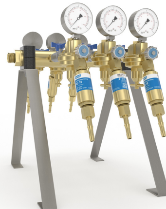
with 4 or 6 outlet points Universal V6