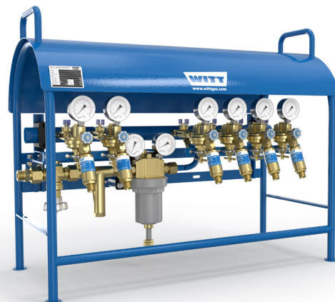
with 4 or 6 outlet points