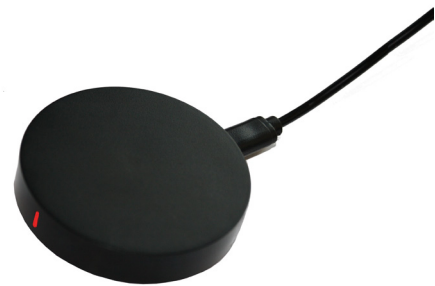
PATBOX charging base