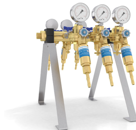
with 4 or 6 outlet points Universal V6